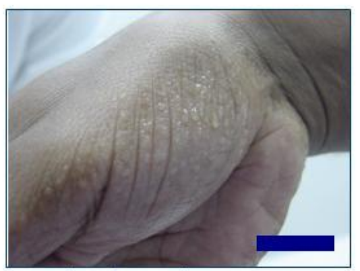
Palmar disease: thenar eminence