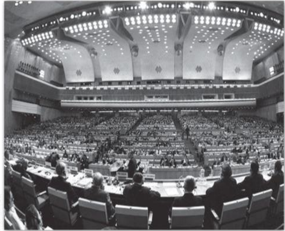
The International Conference on Primary Health Care at the Lenin Convention Center in Alma-Ata in September 1978.