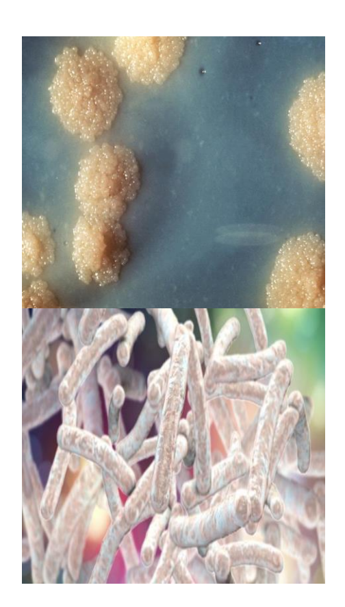
Waxy appearance of Mycobacteria