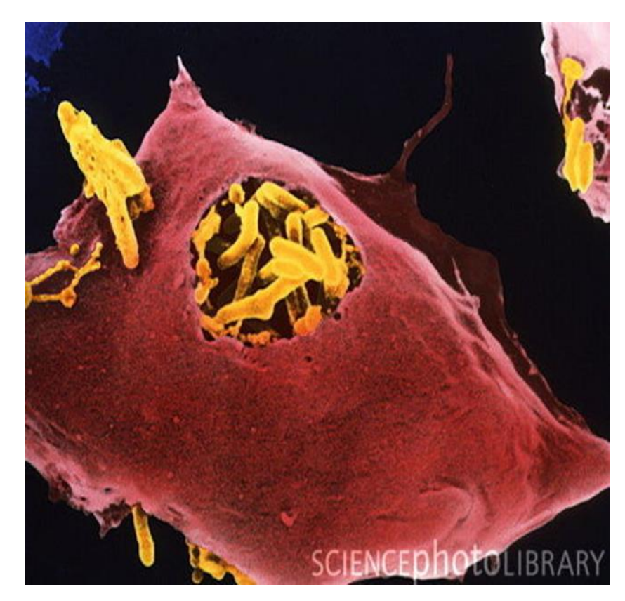
Dormant forms in macrophages