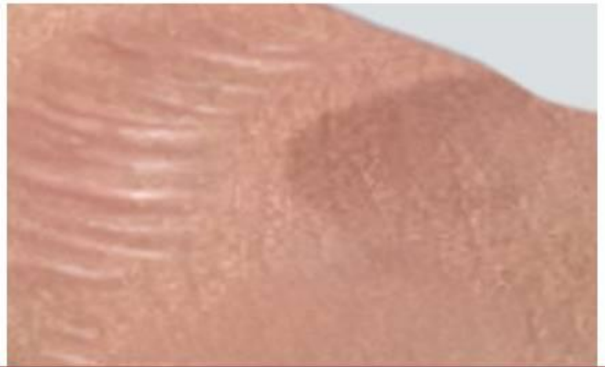
Skin atrophy is the most common adverse effect and occurs due to the anti-mitotic effect of topical corticosteroids & The loss of connective tissue