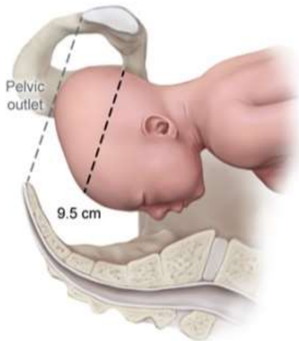
Occiput anterior position