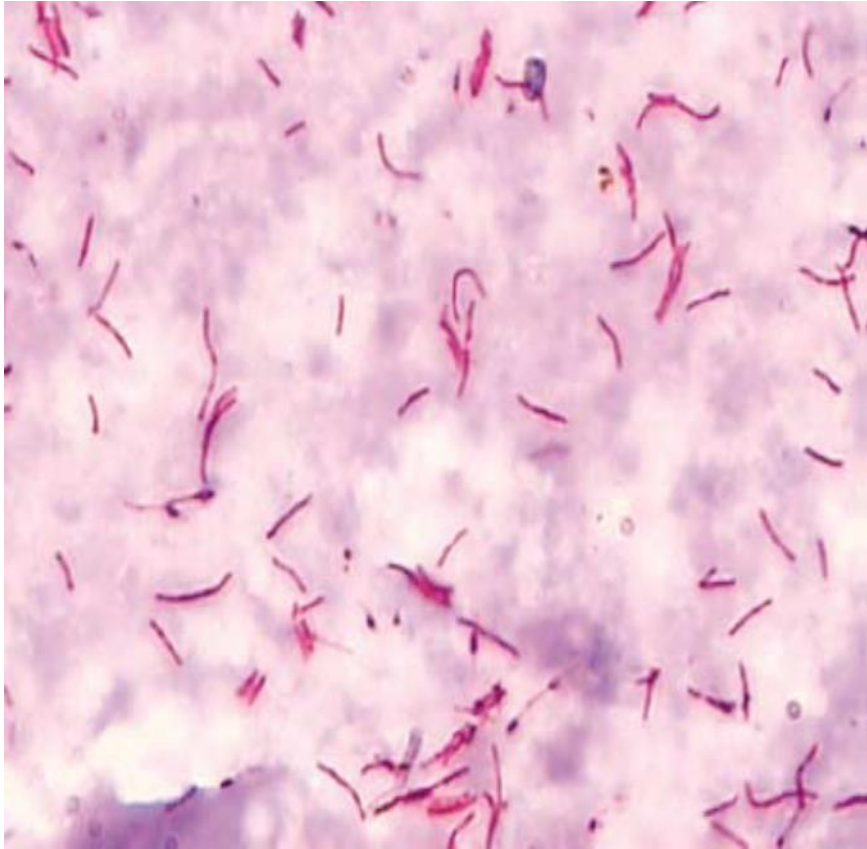
• Acid fast bacilli