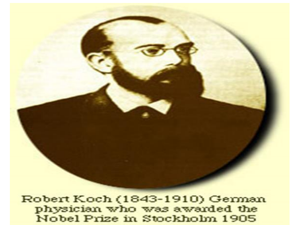
Robert Koch (1843-1910) German physician who was awarded the Nobel Prize in Stockholm 1905