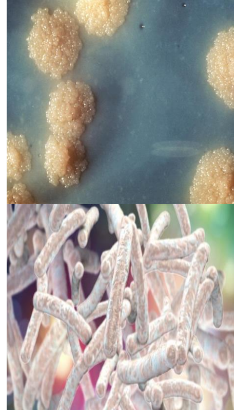
Waxy appearance of Mycobacteria