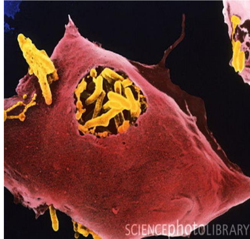
Dormant forms in macrophages