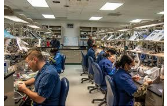
Dental lab. Technician